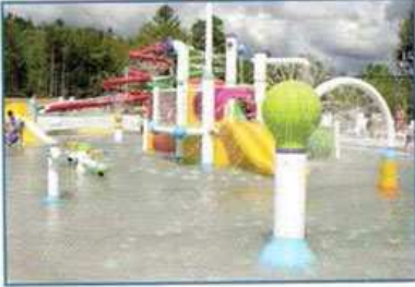
Liquid Planet Water Park celebrates its grand opening.

✦ Liquid Planet Water Park , Candia, N.H., a $4.5 million waterpark with a 5,000-square-foot water spray park with interactive water features (by Empex), a 30-foot-tall slide tower with two 300-foot-long slides (by West Wind Leisure Group), a 1500-square-foot, state-of-