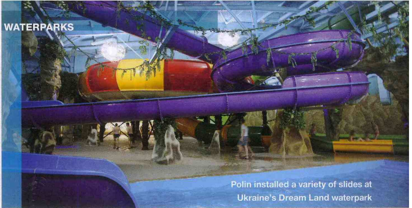
Polin installed a variety of slides at Ukraine's Dream Land waterpark