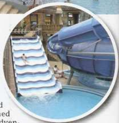
Aquaworld offers plenty of entertainment options for children.

a conveyor-belt-type elevator system. There is also a wide slide, big enough to accommodate three slides side by side: an onion slide offering a shorter but all the more intensive experience, and a 180 m mountain river flanked with steep rocks, designed expressly for the most adventuresome.