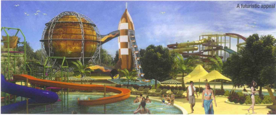
A futuristic appeal