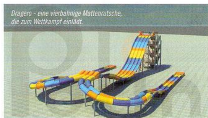
Dragero - eine vierbahnige Mattenrutsche, die zum Wettkampf einlädt.

Auf der EAS 2009 in Amsterdam stellte der türkische Rutschenhersteller Polin zwei seiner neuen Rutschenmodelle vor. Bei beiden Modellen handelt es sich um so genannte Extreme Slides. „Dragero“ ist eine vierbahnige Mattenrutsche, die speziell für den Outdoor-Bereich konzipiert ist. Kopfüber können sich vier Badegäste gleichzeitig auf je einer Matte zunächst vom zehn Meter hohen Rutschenturm abwärts in die Tiefe begeben und dabei an Geschwindigkeit zulegen, um dann wiederum einen Rutschenabschnitt bergauf zu rutschen. An dieser Stelle teilen sich die vier Bahnen nach links und rechts in je zwei parallel verlaufende Röhrenrutschenabschnitte, die dann in Auffangbecken enden. Die Bahnlänge der Rutsche beträgt jeweils etwa 81 Meter. „Dragero“ bietet eine Kapazität von 480 Personen pro Stunde.